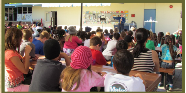
Dean speaks to the crowd in chapel.

There are times when a single room is not large enough to accommodate all the classes interested in a science assembly. So, we go outside! That eliminates all the popular demonstrations on light and color, but with eight hours of demonstration material from which to choose, and lots of willing volunteers, it's not a problem.