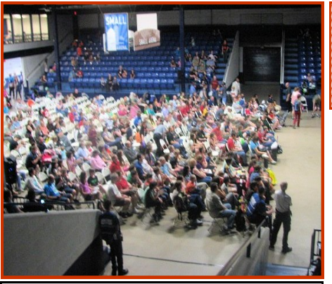
The crowds were gathering for the program (above). Youngsters especially enjoyed the new experiments (below).