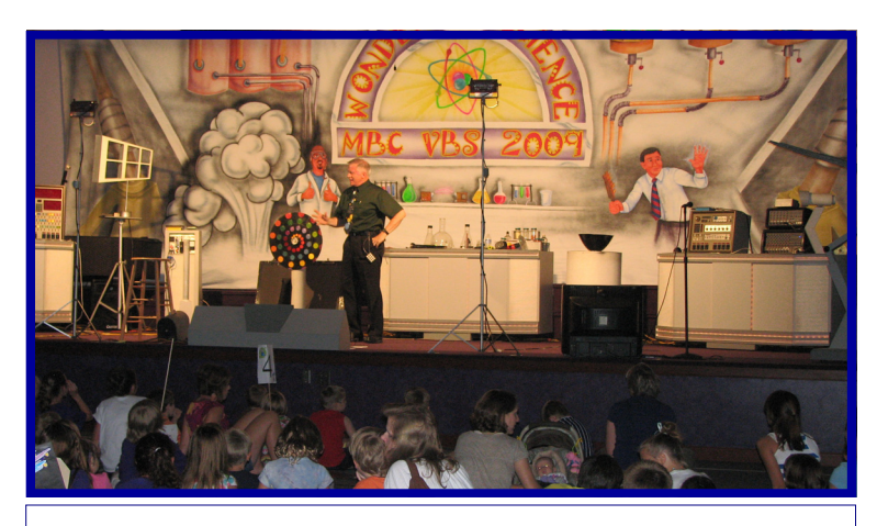
What a beautiful backdrop they painted for our programs!

who volunteered to help staff the program. I've never experienced such a huge, dedicated group of men. A large group of faithful ladies always seem to be present for any VBS, but to have so many committed men is unusual in my experience.