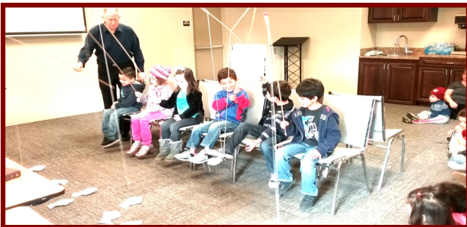
Casting "nets" on the other side (above). Magnetic and Non-Magnetic Fish (below)