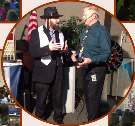
Visitor at Light Night (left) Adult Education Opportunities (below)