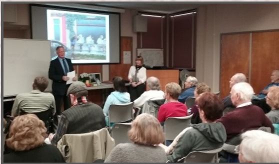
German professors at memorial.

My father, being a naturalized American, wanted his family to speak the language of his new country, English. So, my seven brothers and I heard few phrases in German, unless our dad got angry. I've always been fascinated with languages and was invited to join a group of current and retired German professors and teachers at Cal State Fullerton who meet weekly for lectures in German. One of the professors also introduced me to a group of businessmen and we meet bi-weekly and share dinner, stories, poetry and various arts. Our Cal State class leader, a former chemistry professor, recently passed away suddenly from cancer and God gave me an opportunity, because I was available, to address the group (respectfully) at his memorial about my life and how I used science through WOS.