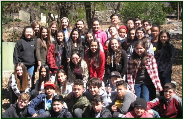
7th Grade Class (left) Arm wrestling bio-physics (right) "Oh great! Now what?" (right)