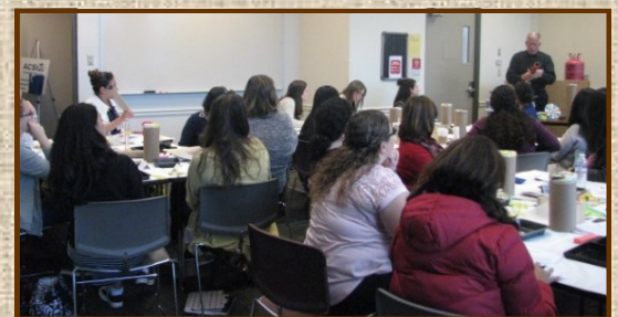
ACSI Teacher's Workshop

One workshop involved air cannons, surface tension powered boats, straw missiles and colorful chromatography with "black" ink. One group didn't want to leave and asked to stay for the next workshop! That kind of enthusiasm would definitely be passed on to their students.