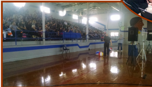
Pierson Vocational High School (left) Coatimundi Science Club (above) San Cayetano Middle School (right)

tation drew standing room only Multiple activities for youth and coupled with powerful gospel messages and literature. What an amazing experience and committed team with whom to partner for their annual community outreach across borders!