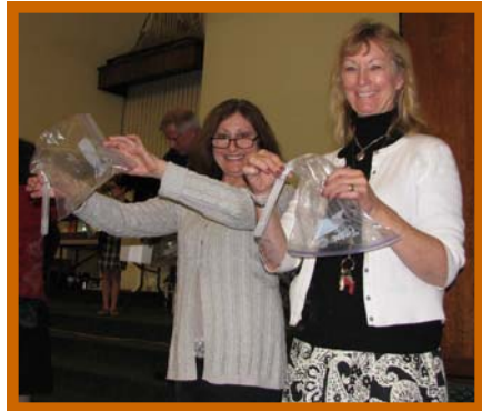
The teachers have fun learning new things!