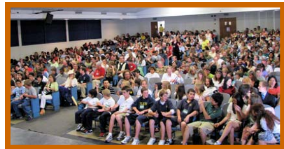
There was a full house at the Science Fair.

WOS had the pleasure of speaking to an auditorium filled with professors, students and parents attending the annual ACSI Science Fair at Biola University. Many of the students present will become teachers and professionals in the future. What an amazing impact Wonders of Science has as we show the relationship that the God of the Universe has with His creation. Over and over again we hear comments from teachers as to how appreciative they were to attend and witness the integration of the Scripture with various disciplines of science and math. Many expressed their gratitude in being able to walk away with so many new ideas to try in the classroom and the effective way the Scripture was legitimately woven into each demonstration.