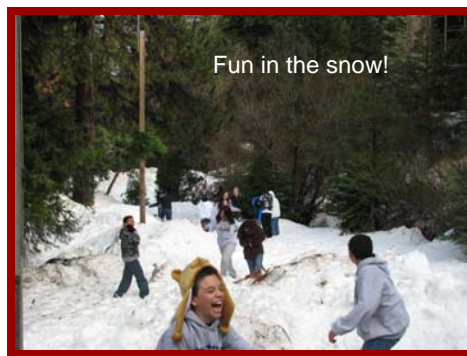
Fun in the snow!