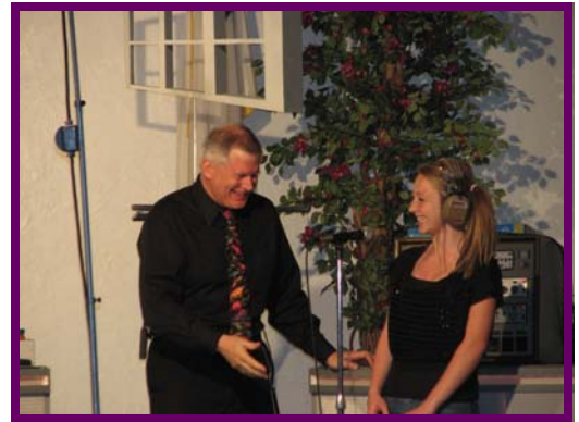
Stutter machine is always good for a laugh.

Throughout the week, youth playing basketball in the parking lot decided to come in, local teachers attended and many others came who were invited by church members. A former science teacher brought her skeptical grandson who had many questions after the program, but was honestly open and listening throughout our ongoing discussion. The teachers who attended acknowledged their students in the audience to the student’s delight. The impact the Lord had will reverberate throughout the community for years to come.