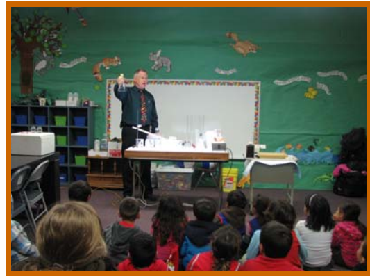
Whittier Christian Schools hosted a Parent's/Kids Night Out.

Many times a group interested in the unique approach of Wonders of Science considers itself too small to host such a program. I assure them that those supporting our ministry are just as excited about small groups as they are those when thousands attend. Many early century ministries dealt exclusively with smaller groups and the Lord blessed in amazing ways as He continues to do so now.