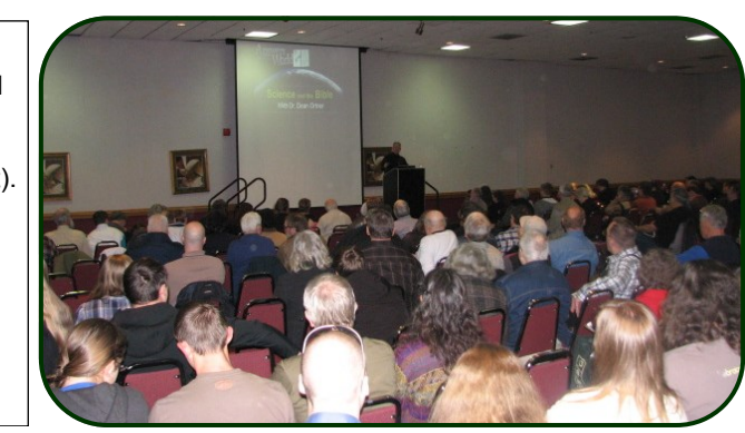
Creation Evolution Seminars (right and left).