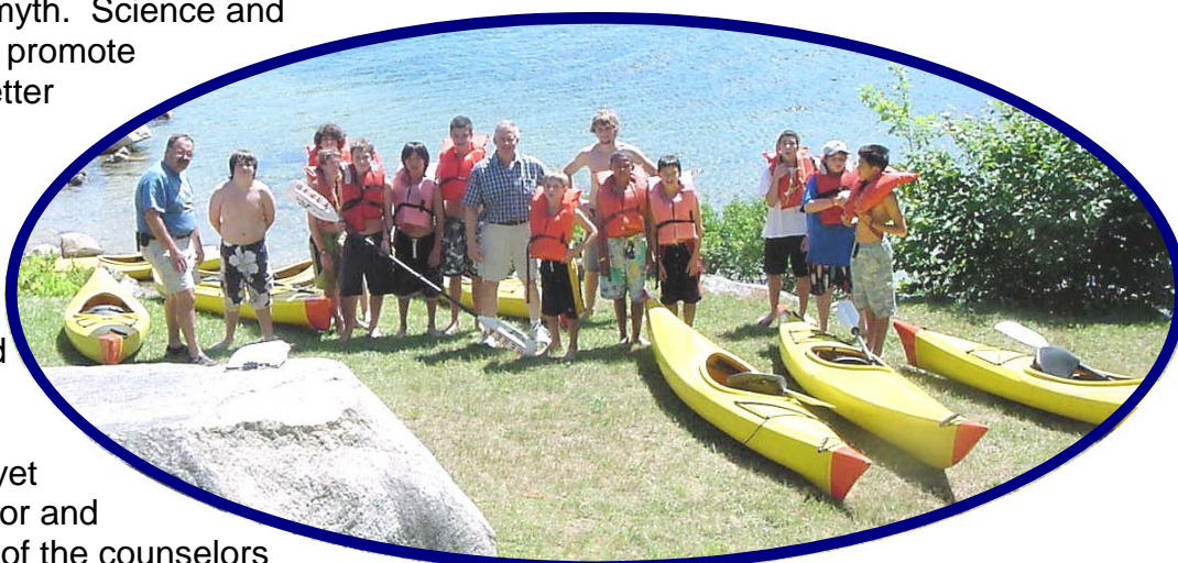
There are many one-on-one opportunities during activities time.