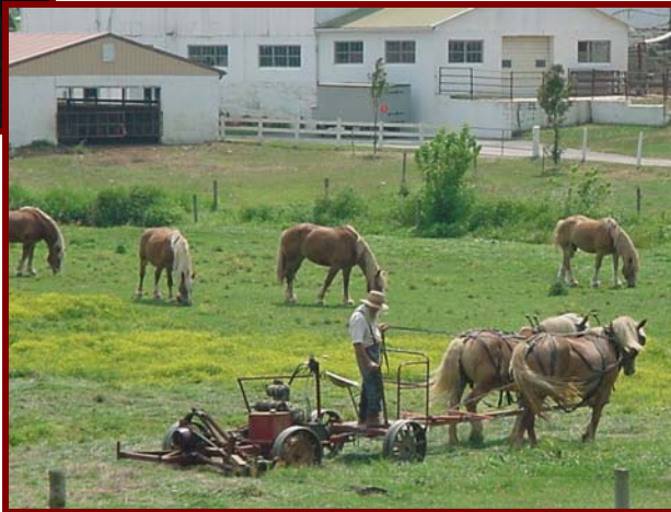
Hershey area Amish only use mechanical machines with no engines or electricity.

One of the leaders responsible for a half dozen young people had been an orphan there and was raised his entire life at the school. He ultimately became a house parent able to effectively relate to those in his care. It was his team that helped us unload and set up for the program.