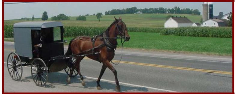
Amish transportation is horse and buggy or foot scooters.