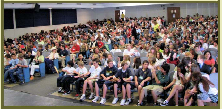
Students gather in the auditorium for Wonders of Science demos.

I have always considered it one of my greatest privileges to be able to work with the Association of Christian Schools International. Again this year ACSI requested the presence of Wonders of Science at their annual science fair held on the campus of Biola University, La Mirada, CA. The enthusiasm the young students have for science and our Lord is truly heartwarming. What a joy to be there to challenge them on to the next levels of commitment in their studies and in their service to the Lord.