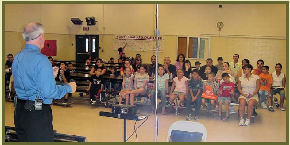
One of the presentations at Chino Hills school.

Wonders of Science was privileged to be included among a dozen or so scientists and doctors from local universities for an all-day series of presentations to the public school students and parents of Chino Hills, CA. Each group alternated through sessions of their choice as we introduced various areas of interest in the sciences. My unique presentation was aimed at tying the fields all together into a cohesive whole orchestrated by "you know Who." I left little doubt without coming right out and saying it.