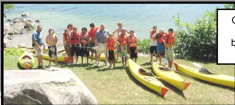
Camp attendees enjoy a break between science sessions.