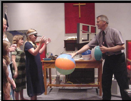
These goggles turn the world upside down.

If you would like to bring "Wonders of Science" to your school, camp or community, contact us today.