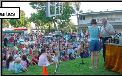
Neighborhood block parties

If you answered "all of the above"...you are right! You'll experience all this and more! The "Wonders of Science" program is a dramatic live presentation that demonstrates the power and design of natural law with challenging insights into the mind and character of its Creator.