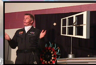
Optical illusions even baffle scientists.

The demonstrations have been presented at all four military academies, the Pentagon, several World Fairs, Olympic Games and even to Ronald Reagan's Presidential support staff at Camp David.