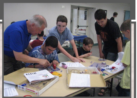
Electronics is always of value.