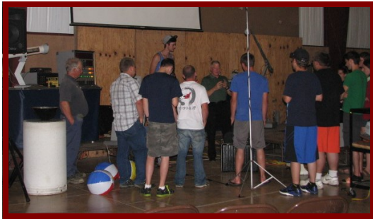
Dean counsels with those who made decisions

CAMP PINNACLE - NY - Camp Pinnacle is one of the oldest youth camps in America! On the top of a mountain in Voorheesville, NY, south of Albany, surrounded by powerful radio transmitters, large groups of young people arrive for a week of camping, horseback riding and craft work, etc. We had the opportunity to present day and evening programs during the opening of their youth camping season.