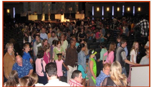
As reported, 3,000 exiting Dean's keynote Million Volt demo (above); 500+ Attended Each Workshop (below)

Over 3,000 attended the evening program and we had a large overflow that came to the next morning's WOS workshops. Many workshop attendees requested the experiment manual I'd prepared for our local California ACSI convention some years before. That manual listed procedures and drawings on many experiments that teachers could present to beginning and advanced students.