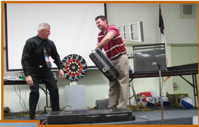
The students at West Covina Christian Academy (left) watch one of their own try to put down the suitcase. (above).

The winter months are usually very busy as I prepare for our school's annual Science Camp. New experiments need to be built and tested before hand. The advantage of being located in Southern California is the abundance of schools for which we can provide science assemblies. Wonders of Science has been presented in both public schools and private academies over the years. Consistent requests for return programs give us many opportunities to illustrate the handiwork of the Lord to thousands of youth, teachers and administrators.