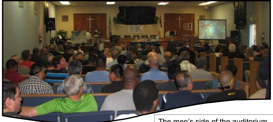
The men's side of the auditorium.

These communities (as do many of us these days) need some hard hitting Bible truths to be moved into action through the Holy Spirit and see lives turned around (see comments). They know what it’s like to feel rejected and unloved. I couldn’t help but join in with their enthusiasm as they cheered and roared with laughter at one of their members, a six foot seven giant of a strongman, wrestling with my gyro suitcase during a demonstration of one of God’s laws. He had an impossible task of trying to turn the energized case around during the applause and encouragement shouted from his friends. They had all pointed to him when I asked for the strongest man in the audience!