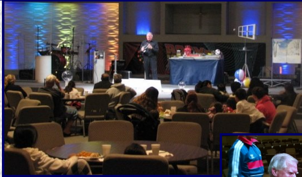
Anaheim Community dinner and demos (left). Plasma globes were a big hit after the demos (below).

One of the most unusual presentations recently was through a local church’s outreach to the Spanish community near Disney Land. A meal was provided to many families and singles who live near the church. Afterwards a Wonders of Science presentation, simultaneously translated into Spanish, was well received, especially by the youth who’d rarely had an opportunity to experience a program quite like it. The Biblical messages really hit home to many and the Spanish pastor then asked me to return for their upcoming family series.