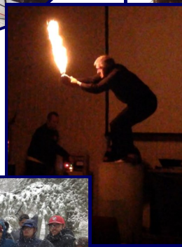
Snow, experiments and fun at Science Camp.