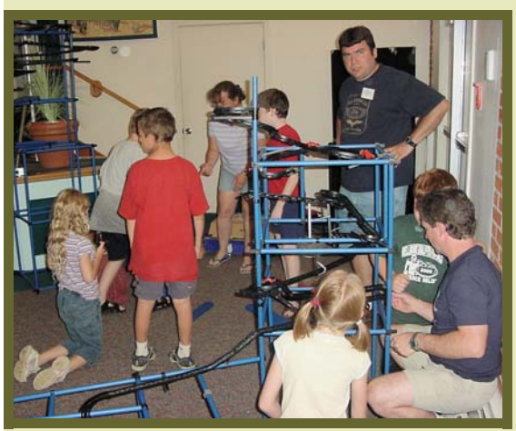
The towers are growing more complex each year.

During a "public gathering" multiple times were suggested which brought objections from other parents who also wanted to attend. Finally, the director said he'd better just stick with the original printed schedule. The groans were very audible, but the subsequent cheers and applause were confirming of my forthcoming suggestion.