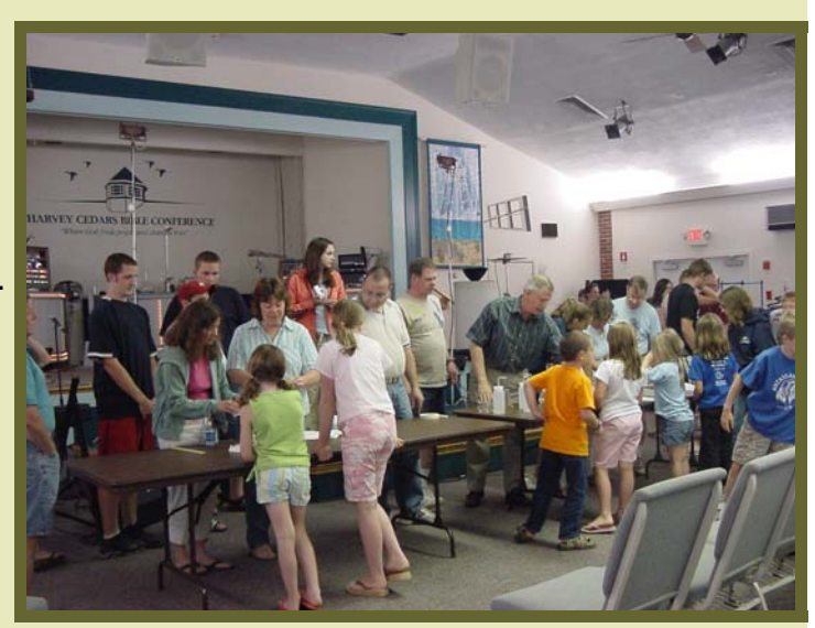
Many in the group, especially the parents, enjoyed the crime solving forensics chromatography experiment.

During the evening sessions we gave the traditional science presentations closing with the gospel message. On one evening alone it was exciting to see a dozen or so commitments made, one-third of them by adults.