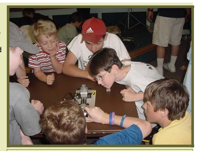
Looks like the flying helicopters and the chromatography experiments were a real hit!

and families present. Scientists were brought in from schools in Lancaster, PA and Harvard Medical School for daytime lectures and labs. The labs elicited the "warning" from my young protector.